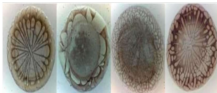
Fig. 1: Dried serum drops [4]; 28 X magnification: a) practically healthy person; b), c), d) people with different types of diseases

a liquid that dries on a solid wettable substrate (under room conditions) takes on a specific appearance. For an example, see Fig. 1. Similar results were obtained in other laboratories [4,5] and by us. The reason for this is a complex of complex physicochemical and mechanical processes, which is determined by the self-organization of dehydration [5]. The kinetic characteristics of a liquid that dries on a substrate reflect the morphological state of the object to which it belongs.